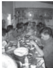
The Molave Dinner