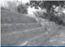
Seating for open-air meetings

superstitious religion of the many who had fled there and died, vainly hoping that the walls of the sanctuary would somehow miraculously protect them. But a clever use of the volcanic ash by local engineers to make nearby roads reminded me of how God similarly turned tragedy into blessing when He wrought the forgiveness of our sins from the tragedy of the Cross.