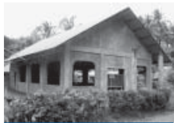
Built to last

But there are many ways in which the ministry in the Philippines is the same. Their hunger for the truth allowed us to teach for well over an hour on several occasions, and reminded me of the eager faces I address at speaking engagements here at home. The challenging doctrinal questions that I was asked revealed an intense pursuit of the truth that mirrors that which I see among grace believers here. And the warm fellowship that I felt wherever we ministered made me feel right at home.