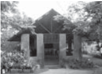
TCM's newest Institute

Monday's schedule included a long car trip to IGBI-Bataan, a drive that follows the path of the infamous World War II Bataan Death March. A huge cross over 35 stories tall sits atop one of the mountains, commemorating this dark spot on the history of human rights. Along the way we passed an area devastated by a volcanic eruption some years earlier. A church half-buried in volcanic ash remained as a grim reminder of the power of nature, and a sad testimony to the