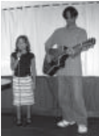
Never too young

the enthusiasm and camaraderie of the young people who sang and played keyboard and guitar, I was reminded of the spirit found in our own Berean Bible Institute here in the States. Later that evening I learned that the dinner we had shared had included octopus. I mused that it is better to learn what one is eating after partaking than before. I enjoyed all the food that I tasted during our travels. Rice is a staple at each Philippine meal, and is featured even at McDonalds, where we occasionally resorted for a quick bite to eat.