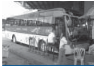
Charter bus to Davao

Saturday a charter bus drove us six hours along winding mountain roads to Davao. Frequently we had to maneuver around stretches of the road that had been sectioned off by local farmers to dry their rice. Once we were forced to take a detour around a bridge bombed by the Muslims, a grim reminder of their strength in that area, and of their desire for a region of land in which to set up their own independent nation, something the Filipino government is resisting steadfastly. Upon our arrival in Davao, Joe remained behind