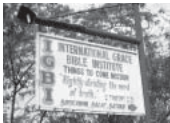
Welcome to IGBI Bataan

Each guard also serves as a greeter and a doorman; it took some getting used to never having to open a door for myself. People are plenteous in the Philippines, unemployment is 11%, and labor is consequently very cheap. Hence unlike many stores here in our country, it is not difficult to find a knowledgeable sales assistant to help you. Literally three young ladies surrounded me, helping me find my size and desired colors as I selected three barongs . This traditional men's dress shirt is worn open at the collar and not tucked in at the waist out of respect for the ever-present heat and humidity.