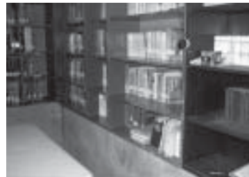
A well-organized library