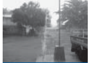
A hard rain