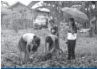
It doesn't get any fresher!

The intimate setting of this church had me thinking of my own church in Illinois, and when a little girl mistook me for her American daddy, I was reminded of just how homesick I was getting for my own wife and children.