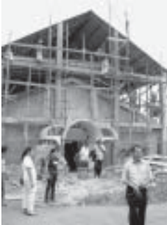
The growing church in Tambulig