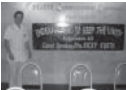
The Manila Church Anniversary Theme

the enthusiasm and camaraderie of the young people who sang and played keyboard and guitar, I was reminded of the spirit found in our own Berean Bible Institute here in the States. Later that evening I learned that the dinner we had shared had included octopus. I mused that it is better to learn what one is eating after partaking than before. I enjoyed all the food that I tasted during our travels. Rice is a staple at each Philippine meal, and is featured even at McDonalds, where we occasionally resorted for a quick bite to eat.