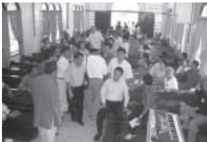
Standing room only at the Molave Meetings