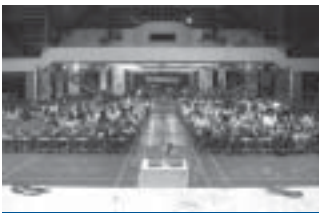
Eager Bible students

Tuesday found us traveling the long road to the national workers' conference in Legaspi. Along the way we passed many Iglesio Ni Cristo churches, a Filipino cult that denies the deity of Christ but has flourished under the teaching of the tithe. Their churches are stately in contrast to the humble houses that surround them, and seem to be everywhere. They have joined the Mormons and other cults in vying for the hearts of the Filipinos in a country long dominated by Roman Catholicism.