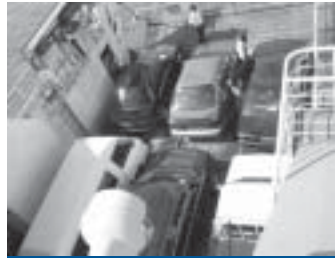
Our van takes a ride