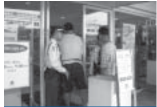
Doormen, Guards, and Greeters

We closed the day with a visit to a local shopping mall, similar to those found here in the United States, but with a few noticeable exceptions. The mall was very crowded, with many people lingering just to enjoy the air conditioning. Each store featured an armed guard at the entrance, a reminder that the Philippine government does not take the threat of terrorism lightly. Each guard also serves as a greeter and a doorman; it took some getting used to never having to open a door for myself. People are plenteous in the Philippines, unemployment is 11%, and labor is consequently very cheap.