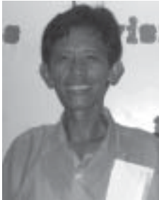
Still working hard