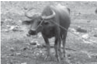
The faithful Filipino carabao

The ministry of the grace message in the Philippines is different than it is here in the United States in many ways. Termites are such a problem that the church buildings are constructed with concrete walls and metal roofs. Joe pointed out that a coconut tree in front of one new church would have to be removed lest someone be severely injured by a falling coconut. Needless to say, these are concerns we don't often encounter here in the United States!