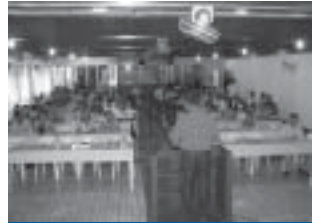
More hungry Bible students

My throat didn't hurt to talk but only to swallow, which makes me think it was not related to preaching. A subsequent visit several days later to a second doctor (this time only $5) equipped me with an iodine-type gargle that finally brought relief.