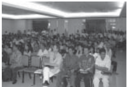
Cebu churches meeting

The Friday night meeting that closed the conference reflected a Troas strategy all its own, lasting until after midnight (Acts 20:6,7). We then rose Saturday at 3 a.m. so that the ten-hour return trip to Manila would get us there ear- ly enough to rest up for Sunday morning’s 5 a.m. flight to Cebu City. There the three local grace