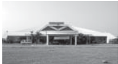
The National Conference

Tuesday found us traveling the long road to the national workers' conference in Legaspi. Along the way we passed many Iglesio Ni Cristo churches, a Filipino cult that denies the deity of Christ but has flourished under the teaching of the tithe. Their churches are stately in contrast to the humble houses that surround them, and seem to be everywhere. They have joined the Mormons and other cults in vying for the hearts of the Filipinos in a country long dominated by Roman Catholicism.