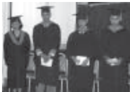
The graduates in prayer