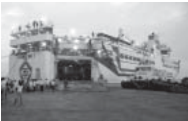
The boat to Ozamis